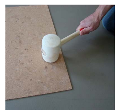
7. Lay down the cork tiles to fit and knock tightly and completely with a rubber hammer to ensure a complete bond formation.