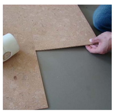
8. Lay down further cork tiles to fit and knock tightly with a rubber hammer.

The variety of materials used and the different construction site conditions, which lie beyond our control, preclude any claims based on this data. We therefore recommend making sufficient trails. Accompanying recommendations and regulations, flooring manufacturer's instructions and the current applicable codes must be observed. Please observe our usage advice in the Technical Information of our products. We gladly provide technical advice and written installing recommendations for concrete job sites. This recommendation supersedes all previous versions.