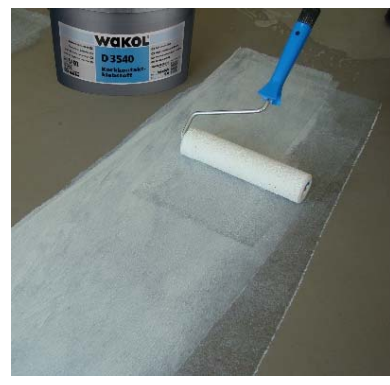
4. Apply adhesive with shorthair velour roller on subfloor.