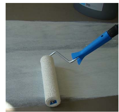
5. Apply adhesive evenly and fully to subfloor, forming a complete adhesive film. Avoid adhesive pools.