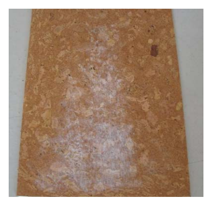
6. Wait until both adhesive films are dried and completely transparent.