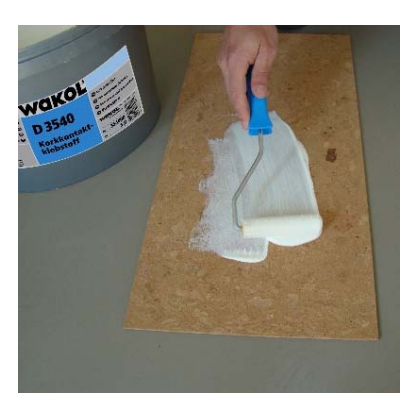
2. Apply adhesive with shorthair velour roller on cork backing.