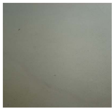
1. Start with a smooth level and dust free cement based subfloor